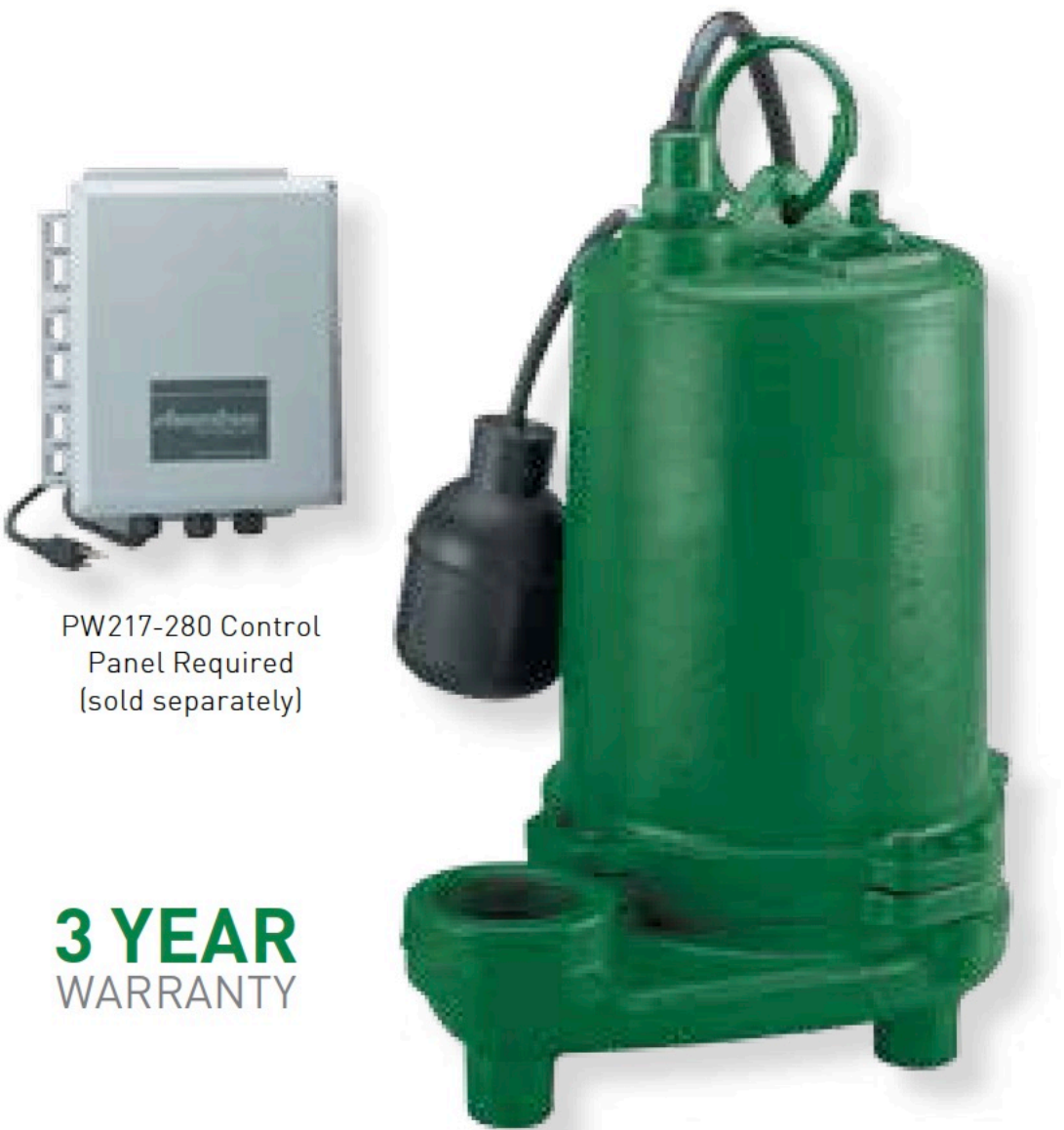
PW217-280 Control Panel Required (sold separately)